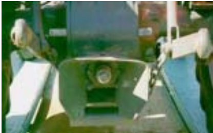
Figure 1: Square masterguard Figure 2: Tapered masterguard